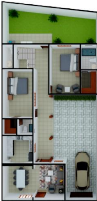
PLANTA PRIMER NIVEL